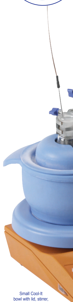
Small Cool-It bowl with lid, stirrer, stand and digital thermometer